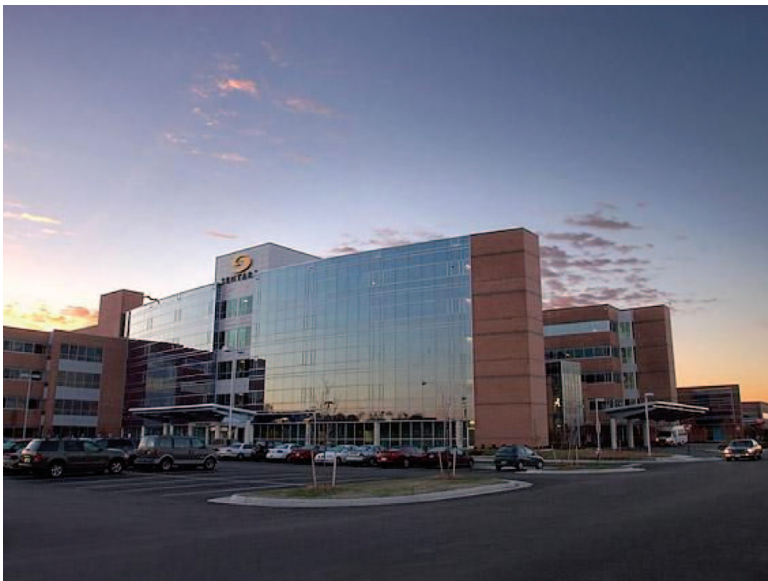
Sentara CarePlex Hospital, Hampton, VA

Founded in 1888 with headquarters in Norfolk, VA, Sentara provides care at more than 100 sites, including eight acute care hospitals, serving more than two million residents of southeastern Virginia and northeastern North Carolina. Sentara ranks among the nation's top 10 integrated delivery networks as published in Modern Healthcare . Sentara is the only healthcare system to attain this ranking all thirteen years the survey has been conducted. It ranked number one in 2010 and in 2001. Sentara was honored in 2010 with the HIMSS Analytics Stage 7 Award recognizing a select few healthcare organizations that implement best practices for EMRs and that operate in a paperless environment.